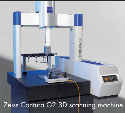
Zeiss Contura G2 3D scanning machine